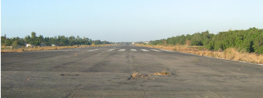
View from the far end of the runway

The competition site will be the Bacolod City former airport. It is right in the heart of the center of town. Bacolod City is a charming cosmopolitan city in the Philippines located at the south of the country.