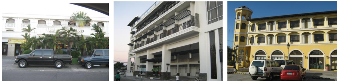
From Left: Sugarland hotel, L'Fisher hotel, and Planta Hotel

The hotels in Bacolod provide comfortable accommodation and service at very reasonable rates. These hotels are situated about 5 to 10 minutes from the competition site.