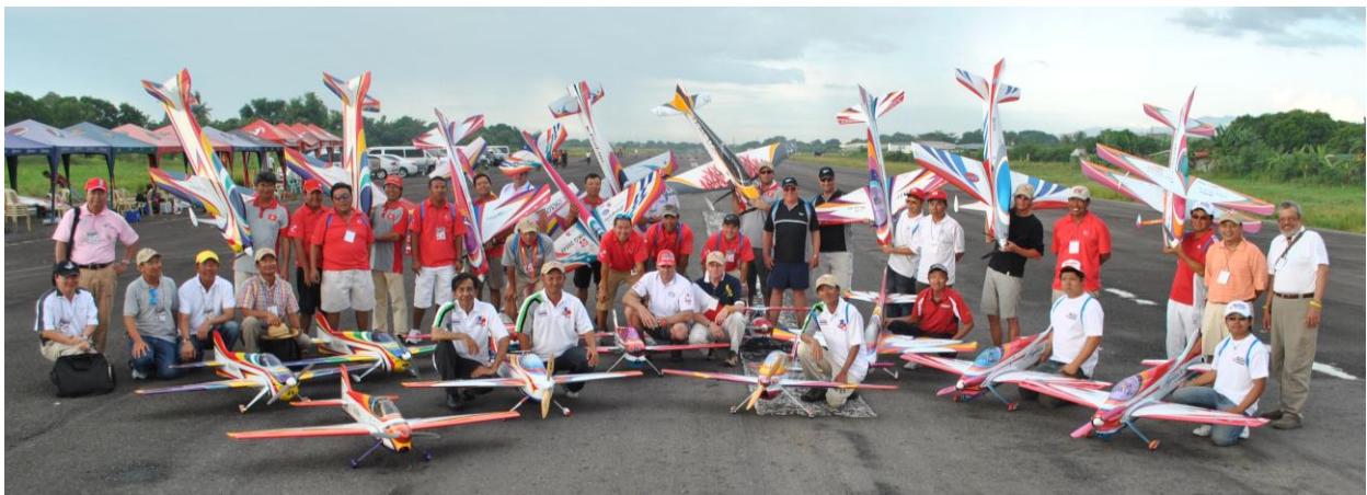
Group photograph of the participants of the 2010 Asia-Oceania Championships for F3A, Bacolod City

The Philippines, through its various Aeromodelling Clubs, organized several local and national events on various sites. The Bacolod airfield was also the venue of a successful pattern event, the Asian-Oceanic Championships in September, 2010, with 28 competitors participating in various classes. The Philippines also hosted the F3C AOCC in 2008, and the Hirobo Cup 2007, in Cebu.